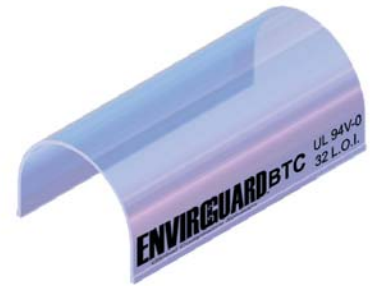
Battery Terminal Cover