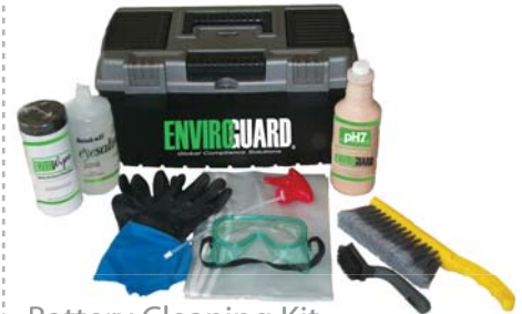
Battery Cleaning Kit