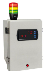
Light & Horn Display Package

Protecting Mission-Critical Facilities Since 1993 SM