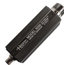
Hydrogen Sensor - HYD-H2 Sensor