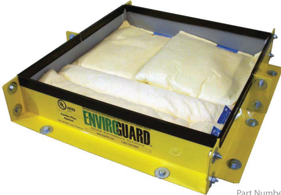
Part Number: EGS-PLUS-WW-LLL

Liner-Based for Flooded & NiCd Battery Applications