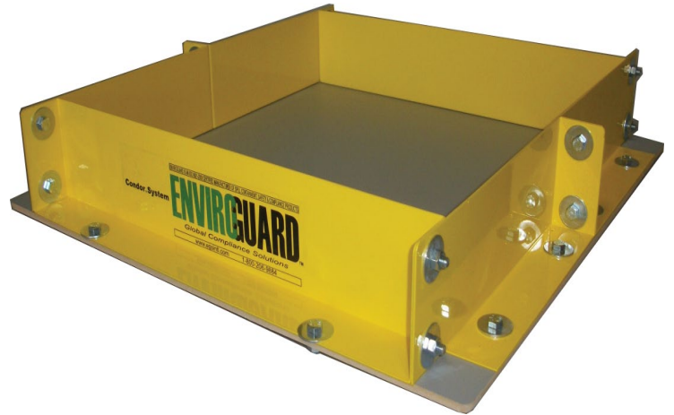
Part Number: EGS WW-LLL